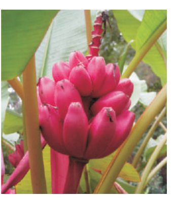
Senduri Kol (Musa Velutina)