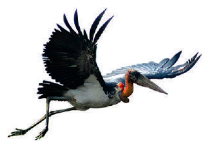
Greater Adjutant Stork ( Leptoptilos dubius )