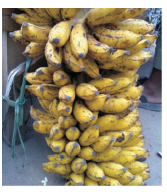
Cheni champa Kol (Musa acuminata)